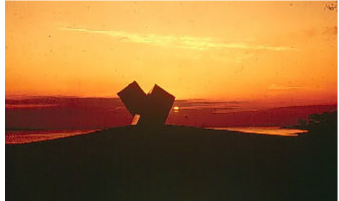
Time Sculpture on the Kingston waterfront