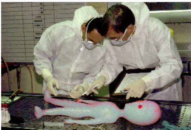
Figure 2 And which granting agency provided funds for this particular bit of Alien Research? DoD? CIA?

4. National Health Research Scholar Award, $50,000 per year, five-year term, research occupies at least 75% of time, completion of PhD, more than two years and less than six years (inclusive) since last doctoral degree, tenable in Canadian